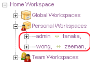
Figure 1-3 Pages as They Appear in the UI

The /ssf/web/docroot/WEB-INF/classes/config/ssf.properties file contains a property called wsTree.maxBucketSize , which, by default, is set to 25. This means that the maximum number of sub-workspaces allowed is 25. If a folder or workspace has more subplaces, Teaming creates virtual buckets called pages. Each line in Figure 1-3 corresponds to a page. The Personal workspaces workspace has two pages.